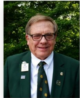
IPDG / LONG RANGE PLANNING