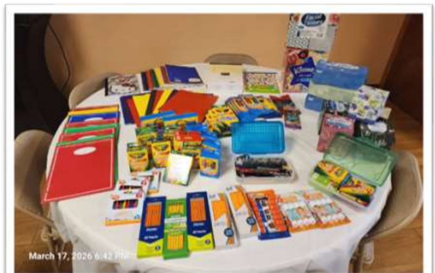
Various school supplies for the elementary students & teachers