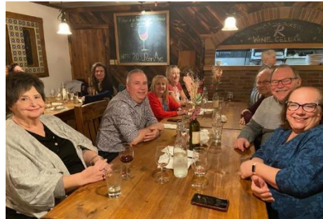
Congolese friends, 839-family and friends