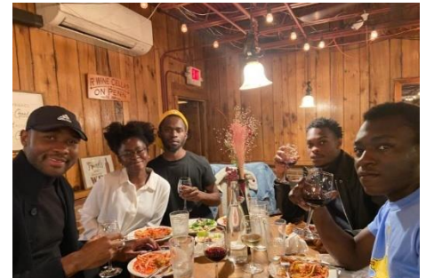
Lions Romeo and Jordan and friend