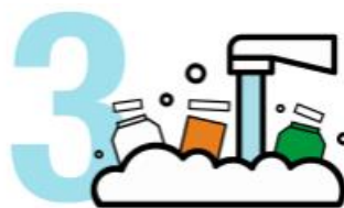
Wash bottles and lids in very hot water and dish soap