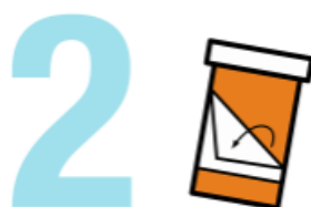
Remove labels, leaving no glue or residue