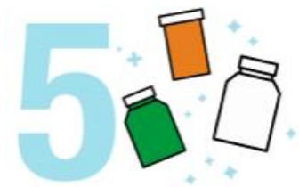
Replace lids on clean, dried bottles