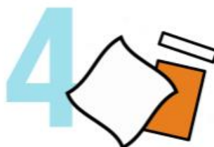
Rinse and dry thoroughly