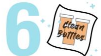
Place clean, recapped bottles in large resealable bags marked 'Clean Bottles'