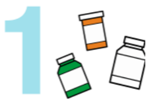
Sort bottles by color and type