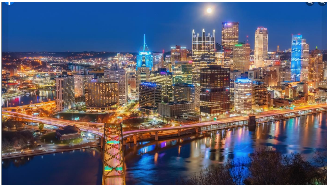
What a beautiful city...