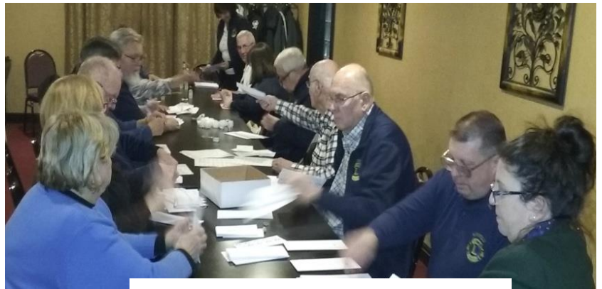
Sometimes, even a visiting District Governor joined the effort.