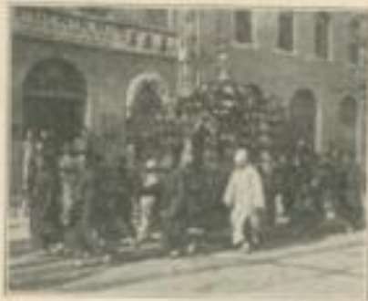
Funeral Procession, Tientsin, China.

But with their joy and gratification for the honor and fraternity thus shown them by Lions International, the Tientsin Lions Club and each individual member also feel in their hearts, a warm gratitude to their organizer. The discouragement and ridicule connected with any new worthy movement have been his, but he plodded along unwearingly toward Lionism's rising sun in the Far East. While, no doubt, the membership would wish to place flowers