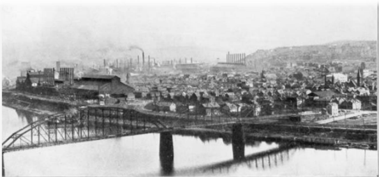
HOMESTEAD FROM THE PITTSBURGH SIDE OF THE MONONGAHELA