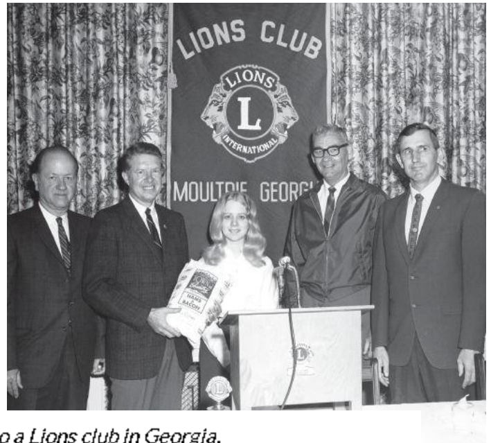
District Governor Jimmy Carter pays a visit to a Lions club in Georgia.