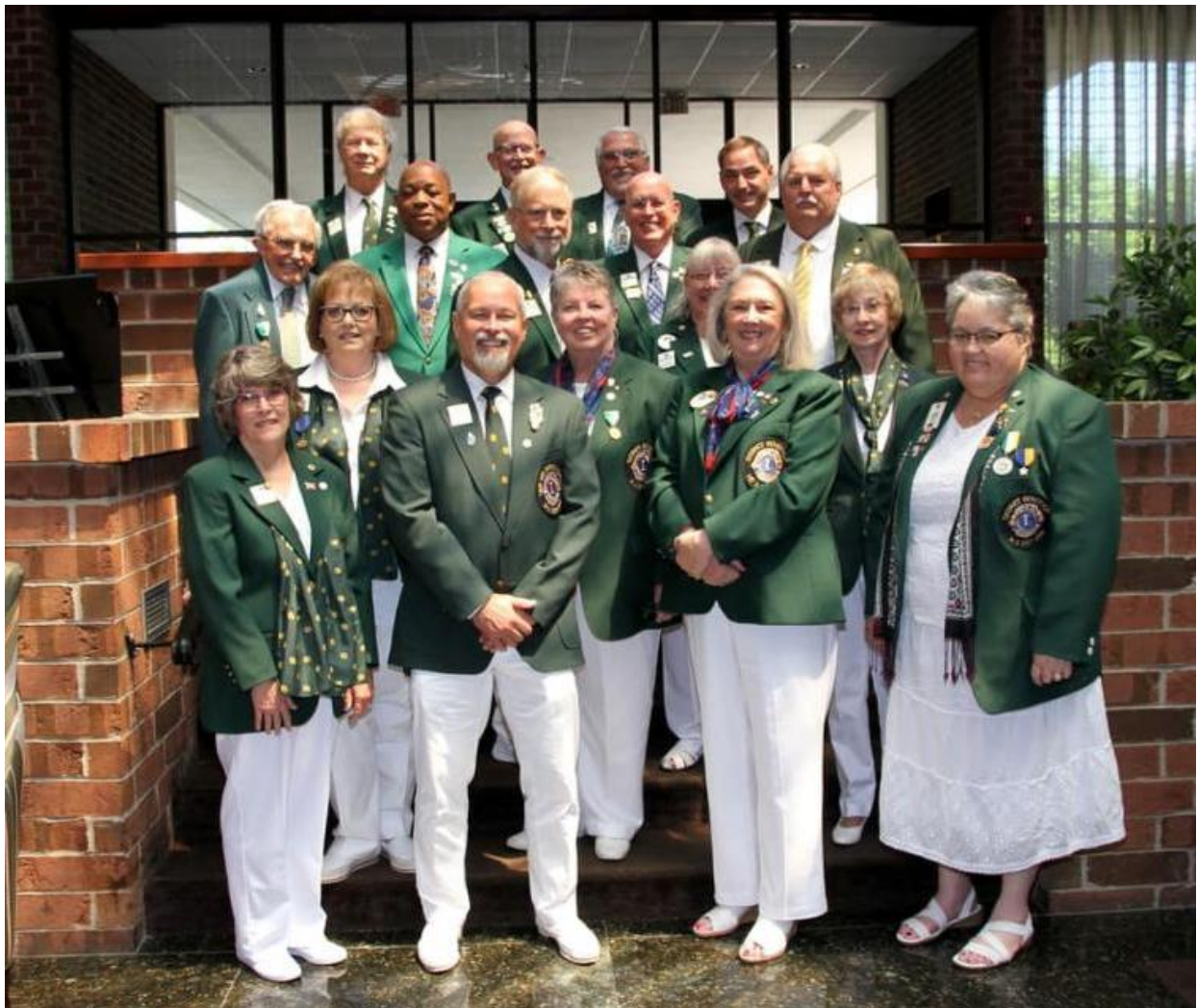
Our State Council of Governors for 2021-2022