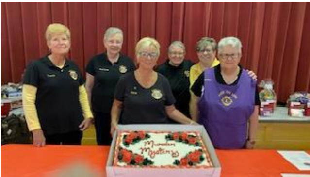
This delicious cake was donated by Patti's Pasticceria.