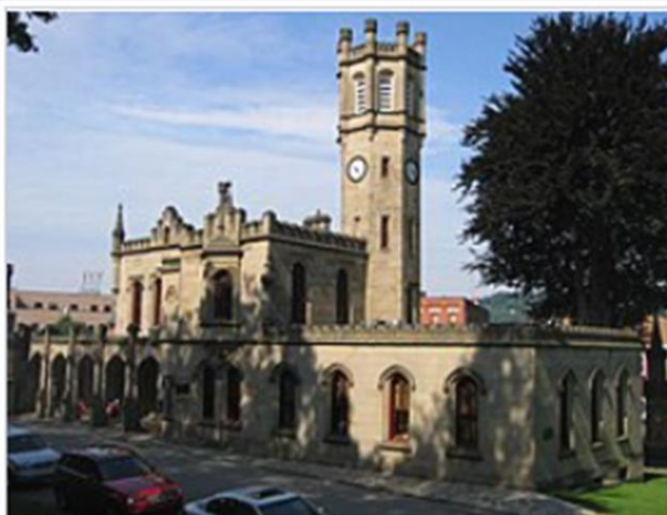
The Butler Street entrance (1870 portion)