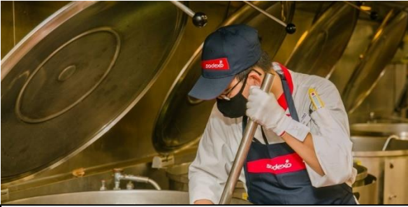
Kevin Tong, 39, stirs a giant vat of food in the mess hall kitchen at the Marine Corps Recruit Depot in San Diego

Kevin Tong fits right in at busy mess hall serving 9,000 or more meals a day. Every day in the mess hall kitchen at San Diego's Marine Corps Recruit Depot, a culinary team of nearly 30 cooks turns out more than 9,000 meals, making it the Corps' highest-volume mess hall in the nation.