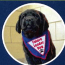
Raider Michigan-Bellamy Creek CF