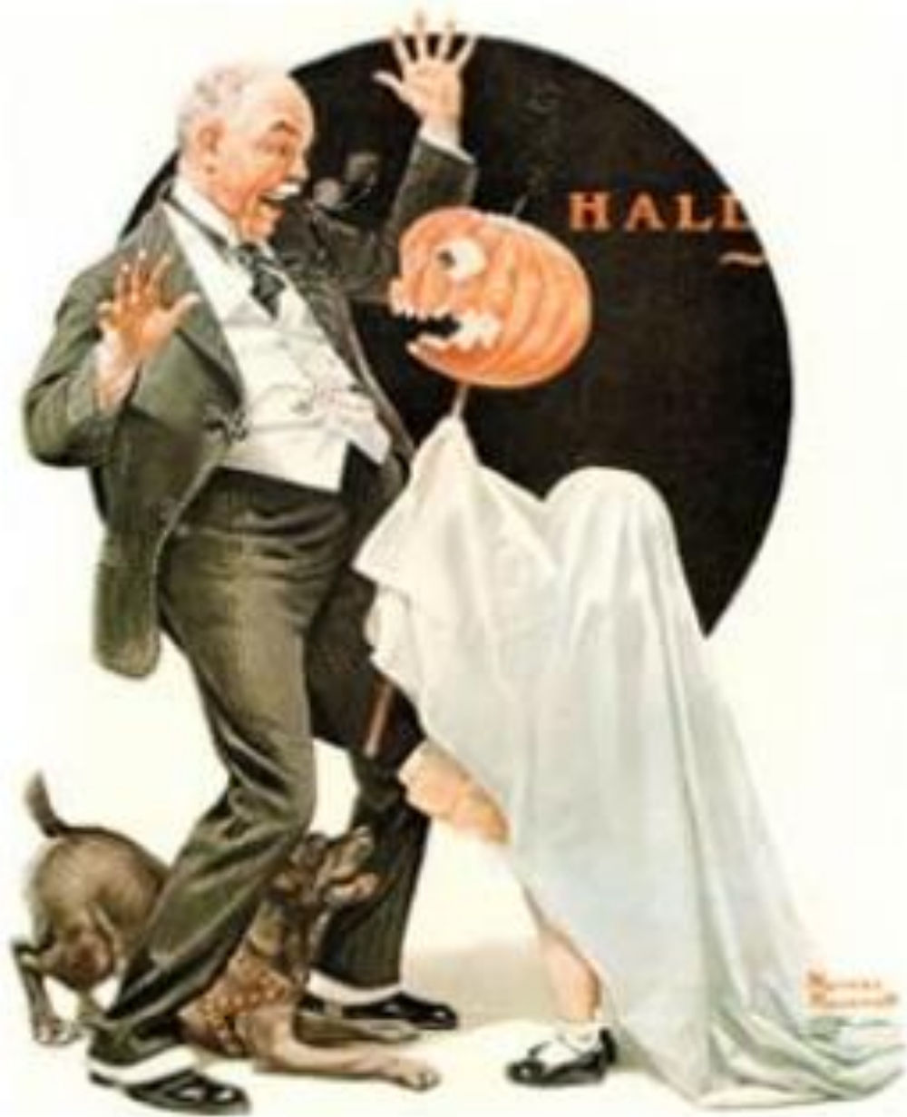
Halloween Print by Norman Rockwell