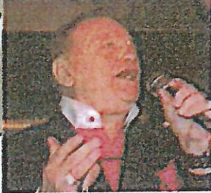
AND SOUL COMMUNICATORS