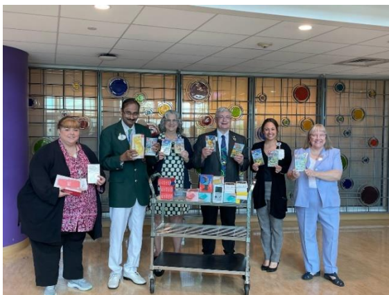
Figure 1 Distributing Nintendo Games and Switches to the UPMC Children Hospital Oncology Unit