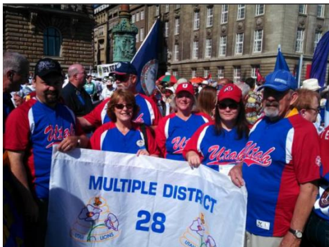
The Utah Delegation in the Parade

from 208 countries around the world were sworn in and the convention closed.