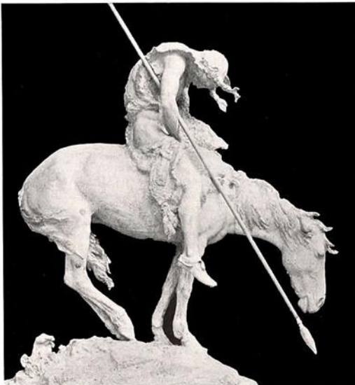
(A Wikimedia Reprint)

(Mormon Missionaries provided at least 10 missionaries each day for valuable translator help at the clinics.)