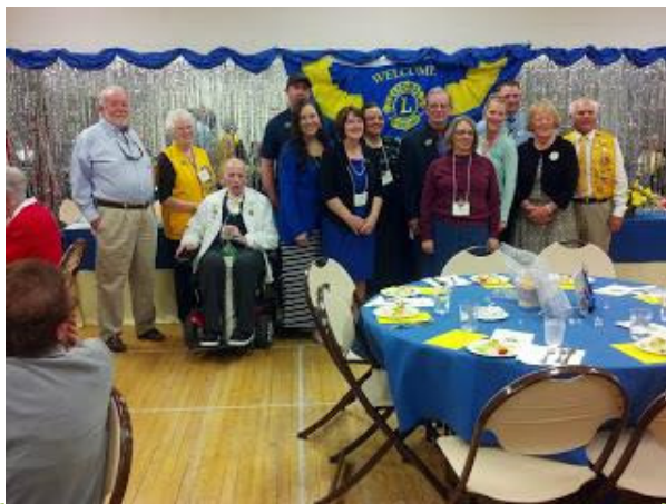
Pleasant Grove Lions Celebrate 75 Years of Service