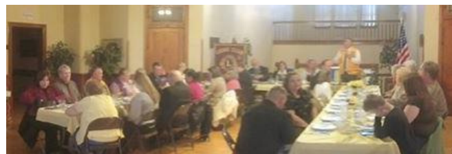
The Payson Lions Club celebrated their 90th Birthday Party on March 13th 2014 at Peteetneet - 7:00 PM. Dinner, entertainment, friends, and fun were on the menu for the evening.

Payson Lions expressed an interest in helping the group. Calls for contributions continued among the local chapter after the meeting had come to a close.