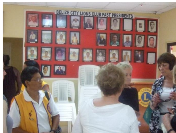
Past presidents of the Belize Club