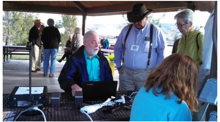
Chapter help out with the Knights for the Blind workshops at Mid Winter.