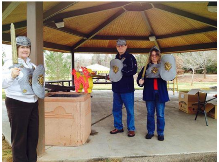
Knights of the Blind from the Pleasant Grove Club at Mid Winter