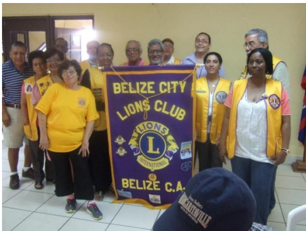
Club members with banner