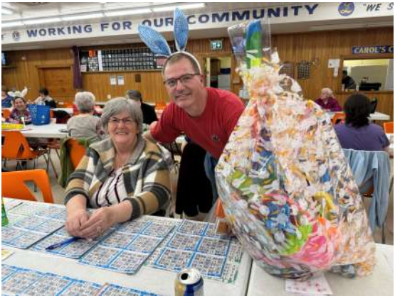
Easter Basket Winner