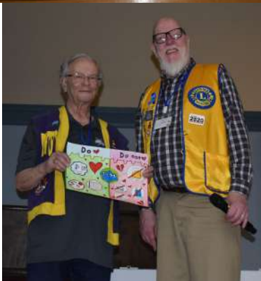
Winner was from the Canso Lions