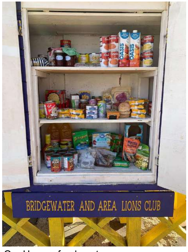
Our Hunger food pantry