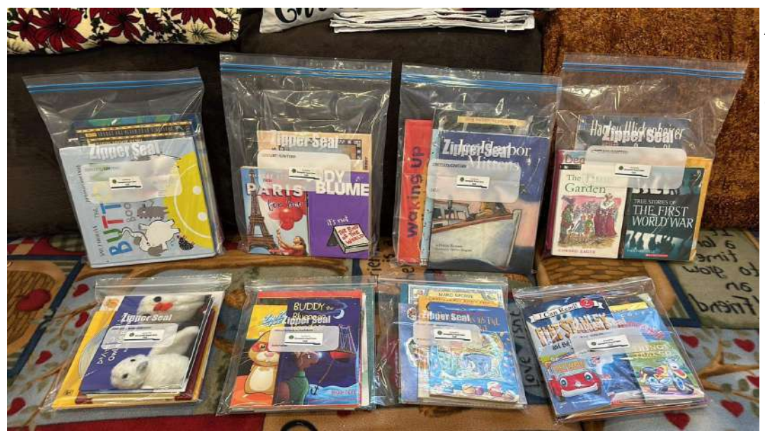
Annapolis Royal gave bags of books for local Food Bank to hand out to children.