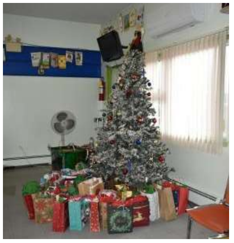
We had gifts for the residents.