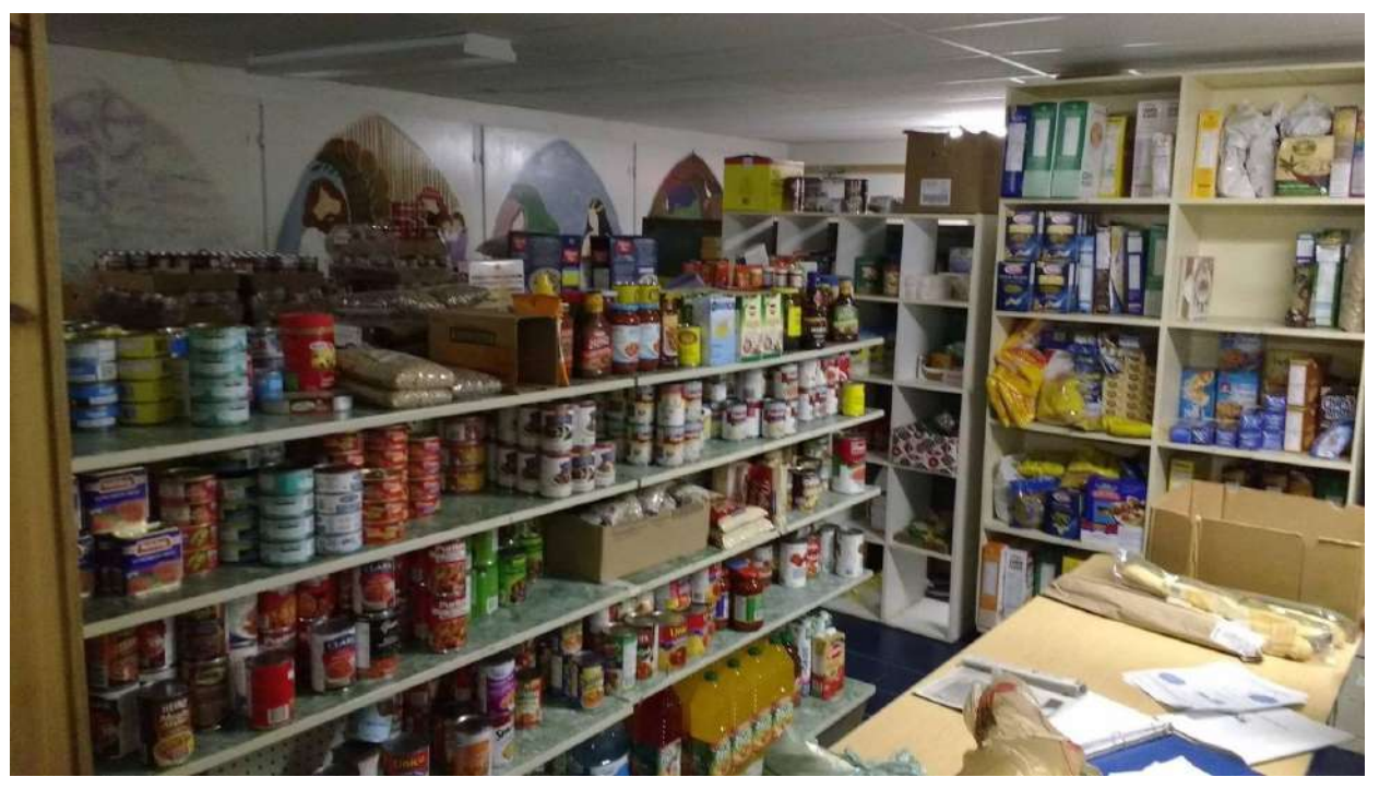
New Germany & Area Food Bank run by our Lions with help from 3 community volunteers.