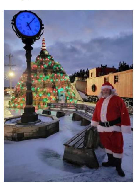
Page 13 NS Lion Dec 2023