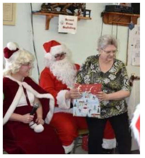
Here is one of the residents getting her gift from Santa.