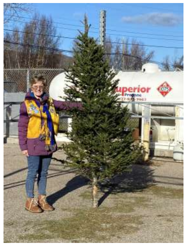
Lion Pam showing the last of 250 trees sold by the Annapolis Royal Lions