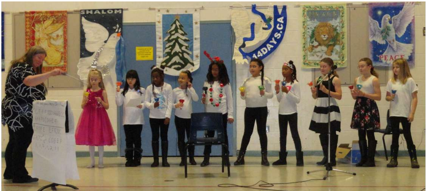
The Bell Park Academic Centre's Bell Choir entertained at the Community Christmas Tree and Carol sing with some tunes and later sang some carols before the tree was lit.