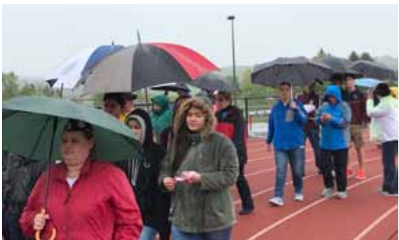
The rainy weather did not dampen the spirits of those supporting the 2017 annual Region L Journey for Sight held on May 13, 2017.

attended by Lions Club members throughout the region.