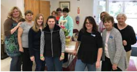
In the photo above Sauquoit Valley Lions working the annual Palm Sunday pancake breakfast.

There was a strong turn out from the community in support of; the breakfast, a bake sale and raffles. Over $1,500 was raised along with a great deal of good will with community members attending and Lions throughout Region L that supported the event.