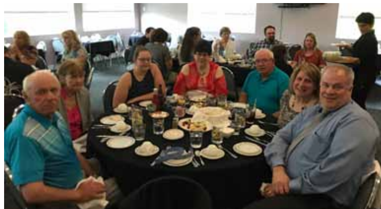
In the photo above Sauquoit Valley Lions and friends enjoying the annual year end Shore Dinner at Orchard Hall restaurant on June 8, 2017.

and Neighbors, Town of Paris Historical Society, Clayville Library, Freedom Guide Dogs, RCIL, JDRF, American Legion Baseball and the Williams Syndrome Foundation. Total donations to charitable causes by the Club for 2016-2017 were $8,500.00.