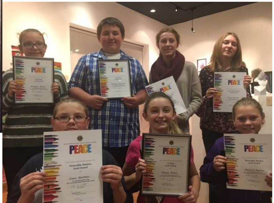
Pictured above is a group picture of the participants with their recognition certificates.