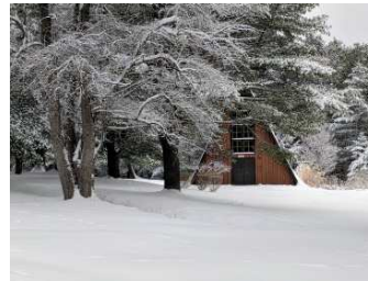
January 15, 2018-Chapel