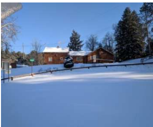
January 18, 2018-Lakehouse