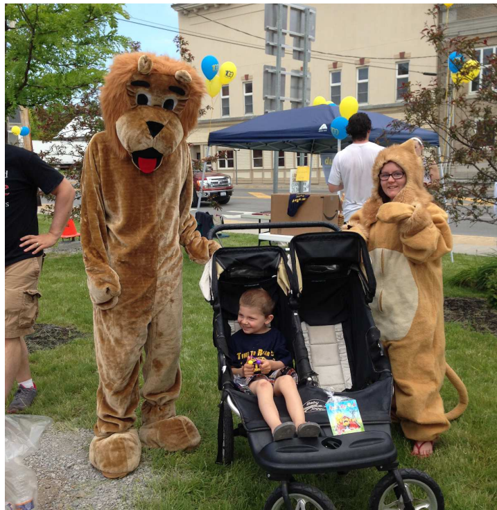
Lions mascots share in the celebration at Lions Time Square with our young supporter!