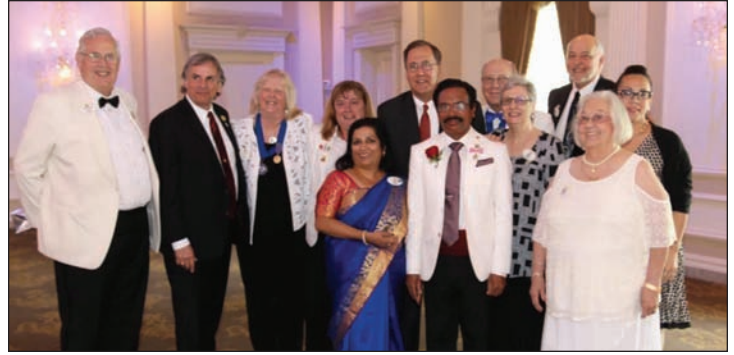
MD20 Council members at the District 20-R1 Testimonial on June 2, 2018.