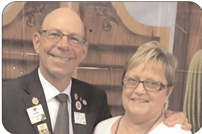
Four PDG's and one "almost" PDG together at the Rochester MD20 Convention