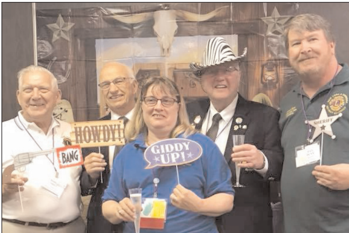
Four PDG's and one "almost" PDG together at the Rochester MD20 Convention