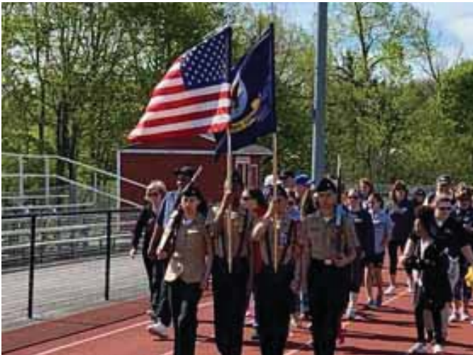
The Utica Proctor High School ROTC color guard leads the first lap of the annual Region L Lions Journey for Sight.

The Sauquoit Valley Lions joined other Lions and Lioness Clubs in the area for the 2019 Region L Lions Journey for Sight on 5/18/19. The event, which was held at the Sauquoit Valley Central School High School track, raised over $14,000 in revenue for local Lions and Lioness Clubs. It was a beautiful day as representatives from the Clubs, the Utica Council for the Blind, the Central Association for the Blind and Visually Impaired (CABVI) and the Proctor ROTC participated. Local Lions Clubs taking part included Clinton,