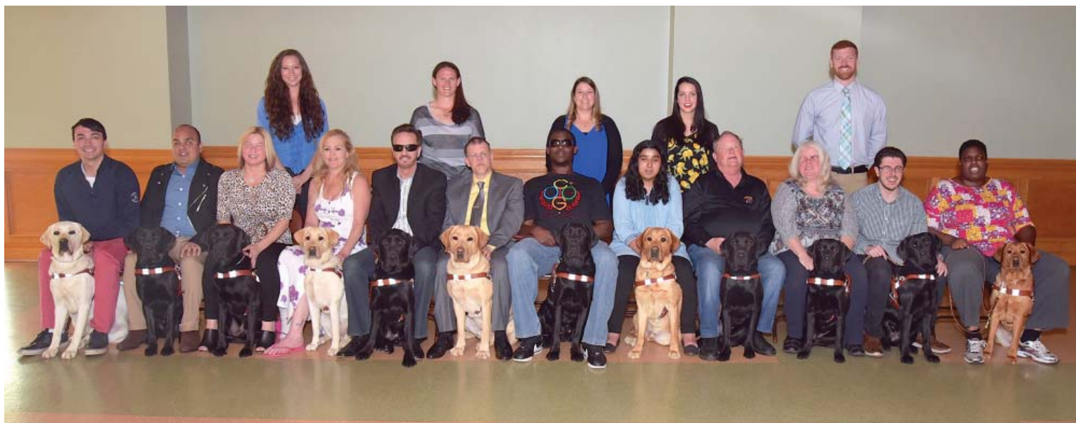
Guiding Eyes for the Blind congratulates the graduates of May 2019!