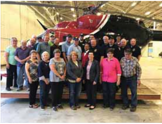
Clinton and Sauquoit Valley Lions met jointly with Mercy Flight Central Critical Care in the Air Med Evac Services personnel at Griffiss Business Park (formerly Griffiss AFB) in Rome, NY on May 23, 2019.

organization was founded in 1992. It provides critical care air medical services to residents - 365 days a year, 24 hours a day. Central includes bases in Canandaigua, Marcellus and Rome/Oneida County, NY.