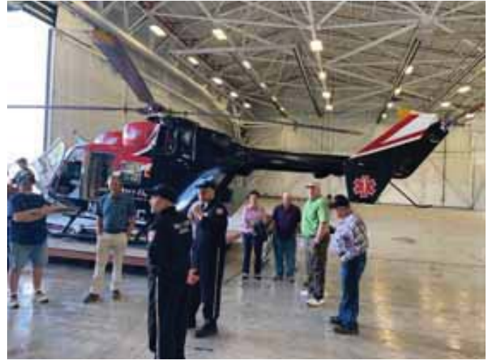
Sauquoit Valley and Clinton Lions tour the Mercy Flight Central facilities at the Rome Air Base.

Lions in a visit to the Mercy Flight Central helicopter facility at the Rome Air Base. Mercy Flight Central was founded as a non-profit in 1992 to provide air medical services to residents of New York State and beyond. Since inception, the organization has served more than 14,000 patients and grown to approximately 70 employees. The organization began operations as an advanced life support air ambulance service