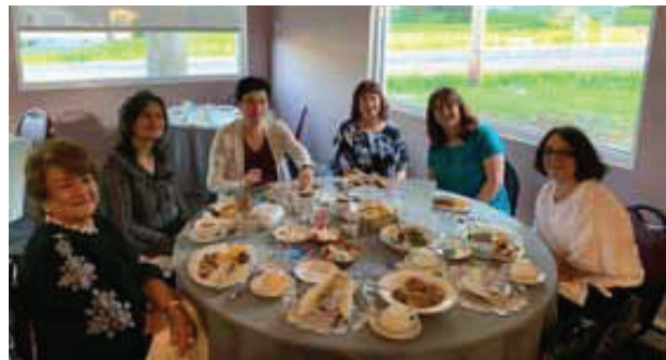
Above: Sauquoit Valley Lions enjoying the year-end "Shore" dinner at Orchard Hall Restaurant.