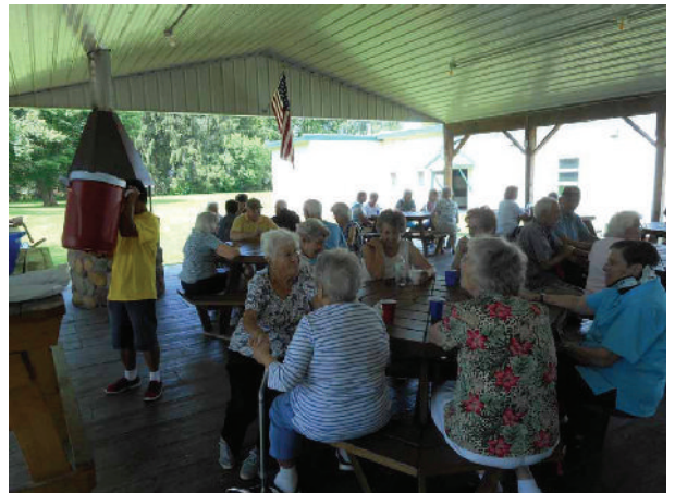
Members of Kirkland Senior Citizens wait to be served by Clinton Lions at 2019 Senior Picnic.