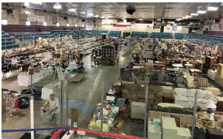
After many Lion hours, things take shape up at Arena ahead of Clinton Lions Garage sale scheduled for August 1 - 3 .