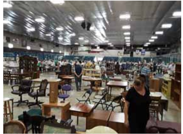
Customers peruse the merchandise at Clinton Lions Garage Sale.

hours to this project, it would not have been the success it was without the availability and support of the Town of Kirkland, Town and their