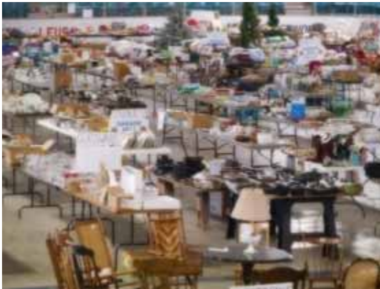
Clinton Lions Garage Sale... the night before we open – we're ready!

sort, clean and price these items and properly group them by categories, e.g., furniture, toys, glassware, sporting goods, etc. for the sale.