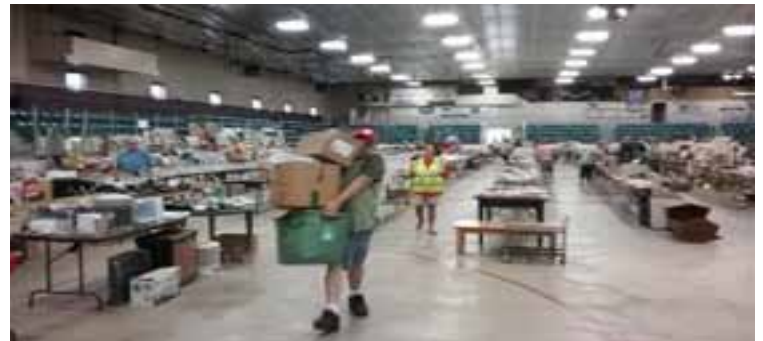
An “early bird” with his stash AND he goes back for more.

We continue collecting used eyeglasses and hearing aids from the numerous previously established business locations in our community and assist at Food Distribution Day at our local Country Pantry. This month at the pantry, “kids packs” were prepared and distributed to families of children who are currently on school summer break. These packs contain nutritious dietary supplements to replace some of the foods they normally receive at school when it's in session. This month the “kids packs” also contained back-to-school items for the fast-approaching first day of school. Approximately