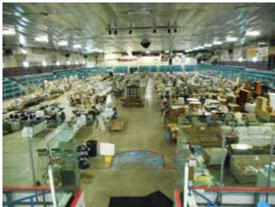
Clinton Lions Garage Sale... a bird's eye view the night before the doors open

After advertising with signs at strategic points surrounding