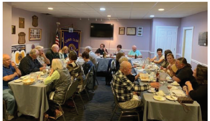
Sauquoit Valley Lions meet at Orchard Hall on September 26th, 2019.

At the meeting the Club donated $300.00 to the upcoming Juvenile Diabetes Research Fund Walk. A donation was also