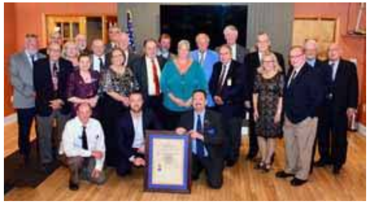
Members of the Ballston Spa Lions Club.