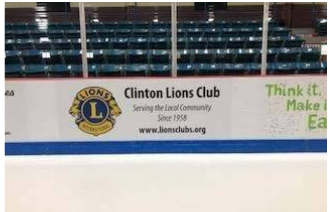
Clinton Lions support Clinton Rink Foundation with Dasher Board Advertisement.

We continue collecting used eyeglasses at our previously established business locations in the area and for the first time