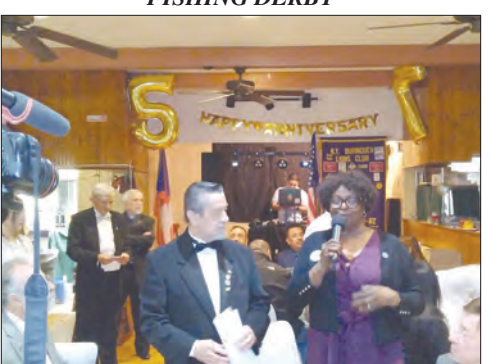
NY BORINQUEN 57th ANNIVERSARY