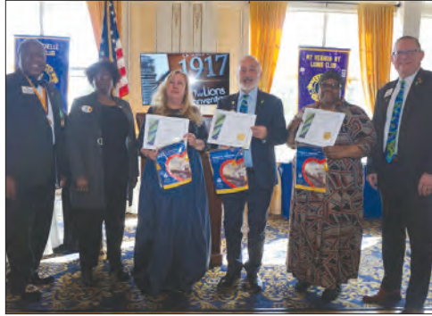
NEW ROCHELLE, MT. VERNON, THE BRONX, 100 YEARS