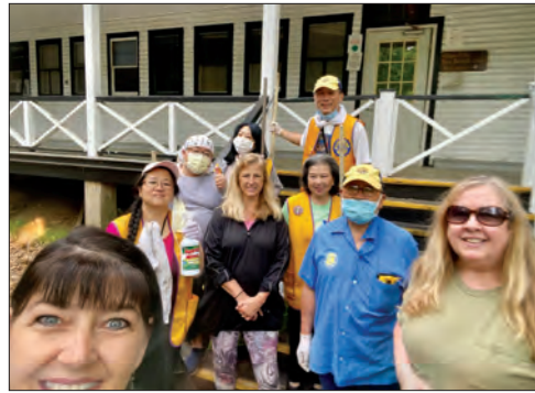
NEW ROCHELLE VCB