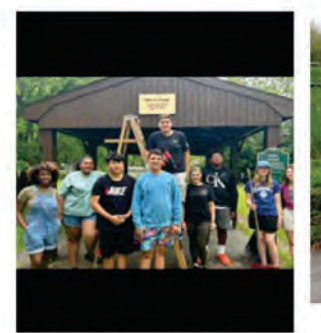
Goshen Leos Park Renovation Project