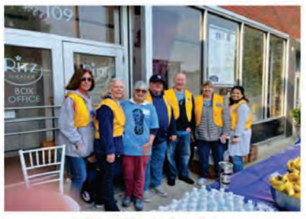
Newburgh Club volunteering at the 5K