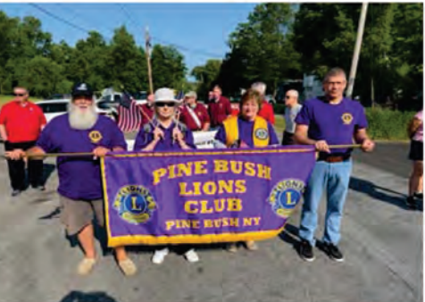
Pine Bush Lions Club Memorial Day Parade