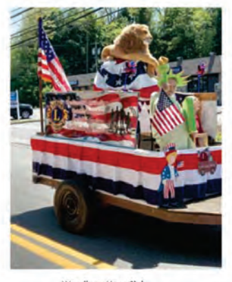
Woodbury Lions Club Memorial Day Parade