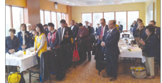
STATEN ISLAND CABINET MEETING