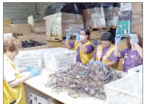
YONKERS MILLENNIUM RECYCLING