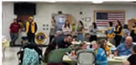
Community members enjoy the SV Lions Palm Sunday Breakfast.

Our annual Palm Sunday Pancake Breakfast and Bake Sale was held at the Willowvale VFD on April 13th. Just over $2300 was raised from the breakfast, bake sale and 50/50 drawing.