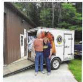
Loaded and ready for delivery