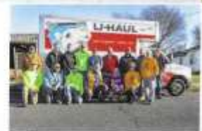
Kentucky Lions at drop off