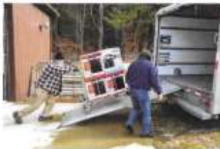
Loading in NY