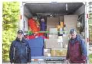
Loaded for Kentucky. Loading up with supplies