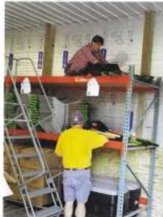
Volunteers filling the shelves.