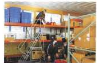
Finding all the supplies

"Where there is a need, there is a Lion"