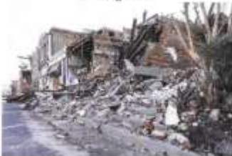
Mayfield, KY devastation Unloading in Kentucky