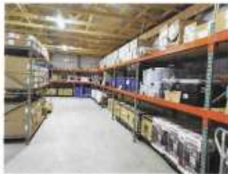
The shelves are full right now. Don't they look organized?