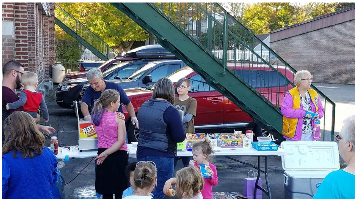
Pictured at right are members of the Saranac Lake Lions Club serving refreshments