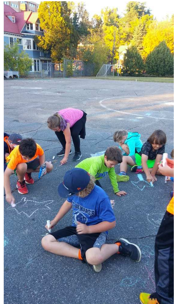
Pictured above are St. Bernard's Students creating some "real sidewalk art" outside the evening of the event.