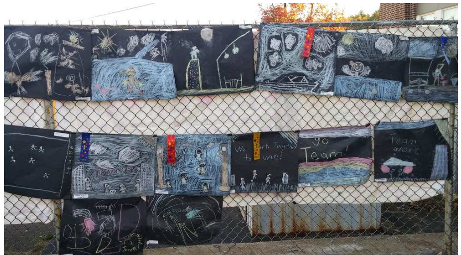
Pictured at right is Art work hung gallery-style