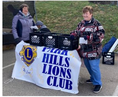
Leader Dog Virtual “Dining in the Dark Event” ↓