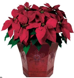
6 inch fancy: $15.00