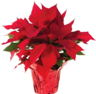
6 inch foil: $10.00