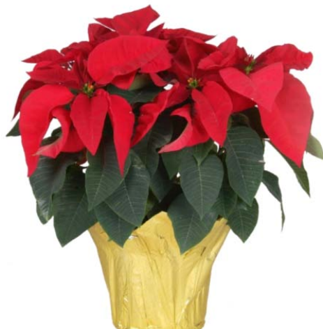
14 inch large: $35.00