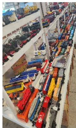
Our Vendors offer Great Variety