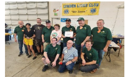
Moose Creek Logging continued its winning streak and was chosen Best in Show Layout by public vote