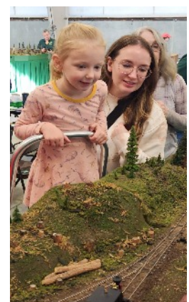
Train Lovers Start Young