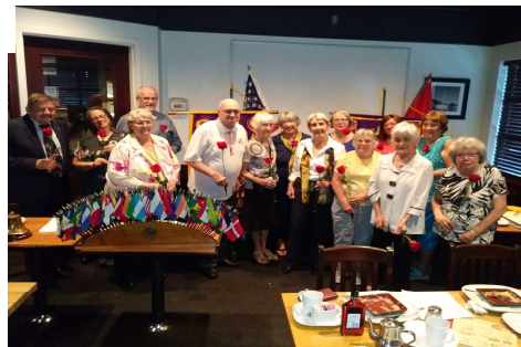
The Whole Gang is here!