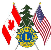
Multiple District 19

Click here to register easily through an online form. If you've never been to a Multiple District 19 Convention, you're in for a treat, because you will meet some amazing Lions who will inspire you, you'll make new friends, and you will get a greater sense of what it means to be a Lion. Lots of learning opportunities and oodles of fellowship. Sign up now!