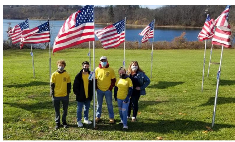
United For The Troops Mahopac Leo's Club & Mahopac Lions Club, Mahopac NY

On November 15, at the Freight House Café, and on November 20, at Red Mills Convenience Center the Mahopac Leo's Club & Mahopac Lions Club sold Holiday Ornaments designed and created by a District 20-K1 Leos. Revenue in support of the Mahopac scholarship fund!