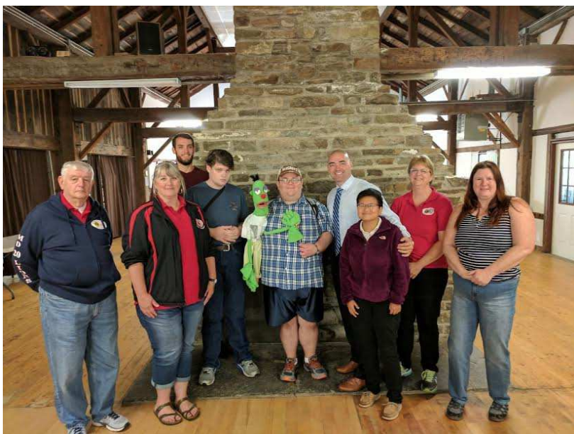
Staff, Campers and Families from Lions Camp Badger: