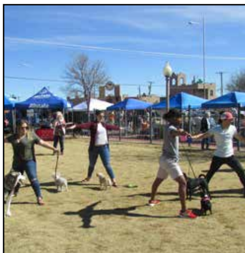
Yoga With Your Dog was a popular event at Bark & Brew.