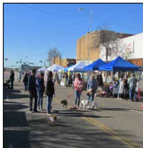
There were 40 booths on both sides of Buddy Holly Avenue and part of 18th Street. We appreciate their support!