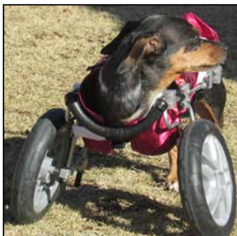
One of the participants in the Special Needs Dog Race.