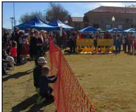
The crowd cheers as the dachshund race participants head out of the gates!