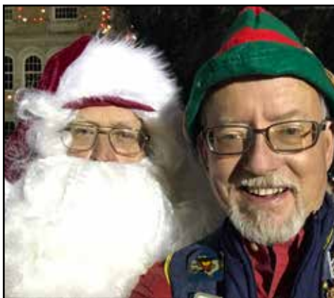
Lion Santa and his elf at the TTU Carol of Lights Run (left) and Cardinal's Sports Center (right)

Another Santa visit was used to promote another store’s “Angel