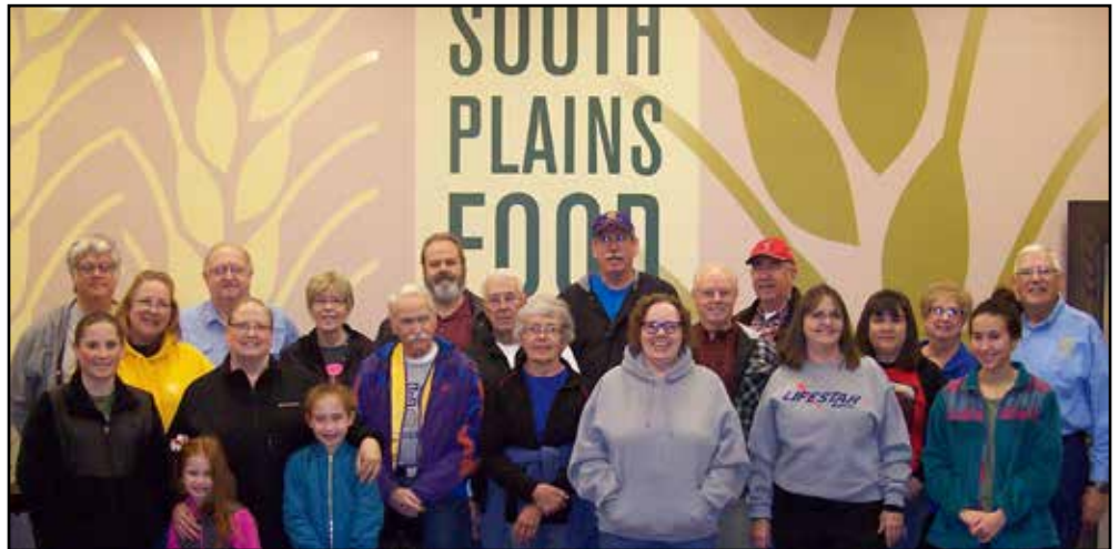
Friends of the Food Bank

I regret that I cannot mention the actions of every club, but I hope that the major point has been made: Lions of District 2T2 do care about their fellow man and are actively fighting against Hunger!!