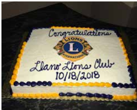
CLUB BIRTHDAY CAKE