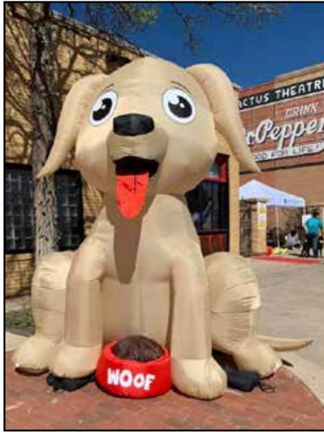
This friendly pup welcomed visitors to the first Bark and Brew event in downtown Lubbock on March 23, 2019.