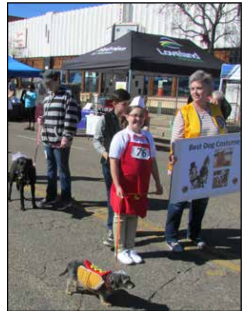
Participants line up prior to the start of the Dog Costume parade at the 2019 Bark and Brew event.

bock Hub Lions Club, won the Lions Club traveling trophy last year.