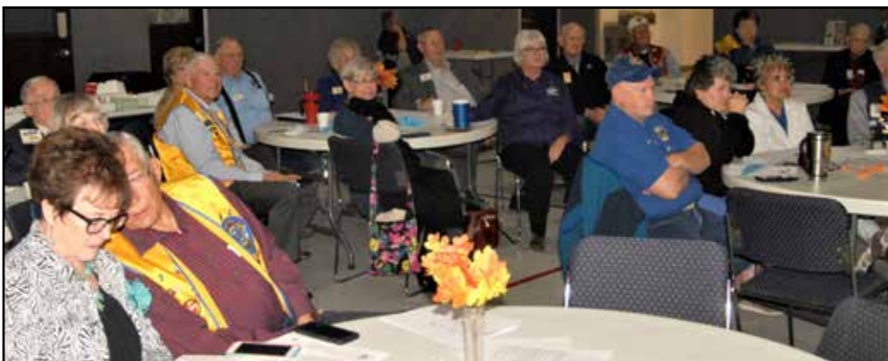
Many Lions from across District 2-T2 attended the half-day meeting in Lubbock.