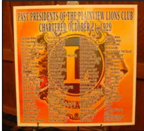
All Past Presidents of the Plainview Lions Club were listed on this poster. The club was chartered October 21, 1929.