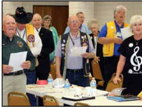
Lions sing "Home on the Range" during the convention kickoff breakfast in the Mabee Learning Resources Center at Wayland Baptist University.