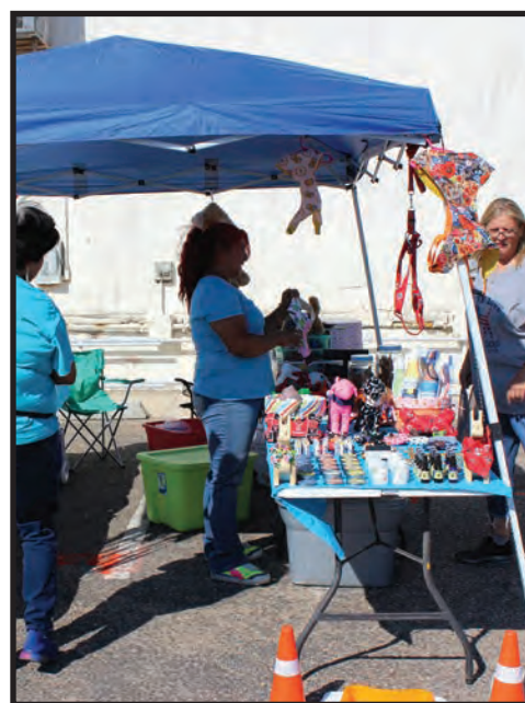
Bark and Brew Vendors

Spectators cheer on the small dog race participants at the Sept. 19 Bark and Brew. Other races were held for wiener dogs, Lions' wiener dogs, and special needs dogs.