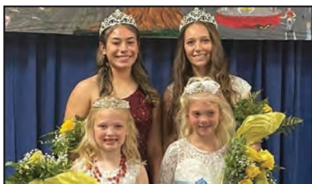
Harvest Festival Royalty

Webinars for the 2020-2021 and 2021-2022 Lions fiscal years are available for online viewing at https://texastuesdayconnections.org/