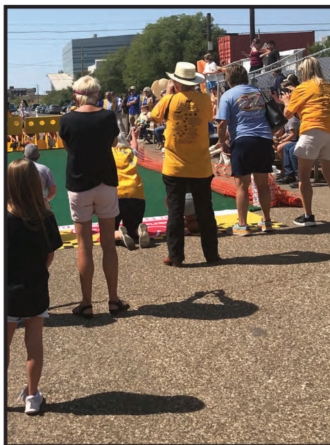
Finish Line Fans

April 24 should be a better time for all -- even if it is windy!